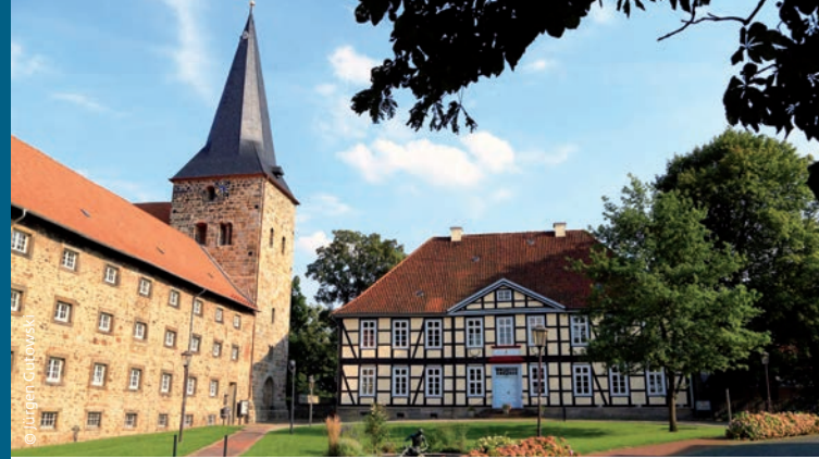
▲ Kloster Wennigsen is part of the endowment to the Klosterkammer.

The Klosterkammer has a staff of around 160, about half of whom work in the central office in Hannover. The other half are spread across various sites in Lower Saxony, including Northeim, Lüneburg and Osnabrück. After the state of Lower Saxony, the Klosterkammer is the second largest owner of lands and forests, amounting to around 40,000 hectares (approximately 99,000 acres).