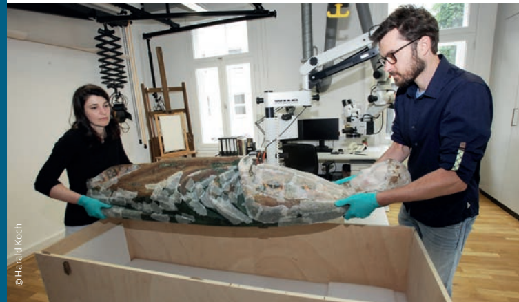
▼ Staff in the in-house restoration workshop maintain and preserve more than 12,000 works of art that form part of the foundation's assets.

95 per cent of the endowment, consists of land and buildings, many of which are important heritage monuments. Ever since George IV established the Klosterkammer as an administrative authority, its main responsibilities have remained unchanged: management of the foundation's assets and decisions on how to spend the investment income. Since its establishment, it has also played an outstanding role in the preservation of heritage buildings and monuments. From the onset, the Klosterkammer has had its own construction department.