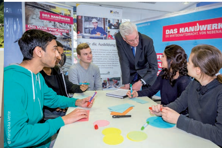
▲ One focus is on communicating of cultural contents and competences to children and adolescents, as seen in the project entitled "Show what you can do!".

Each year, the Klosterkammer also supports around 200 church, social and educational projects across Lower Saxony to the tune of approximately 2.5 million euros.