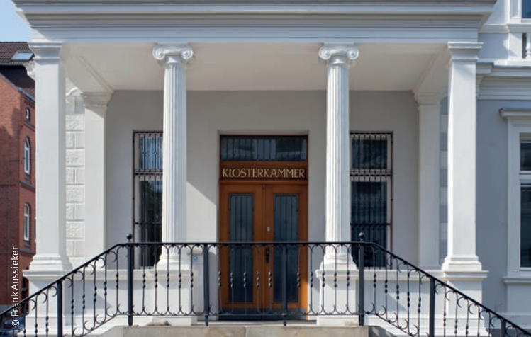
▲ The main entrance of the Klosterkammer's Central Office in Hannover.